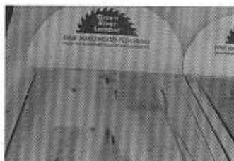
Green River Lumber from the USA is a rather new wooden flooring partner for the Polish trader.

Claims management is a task, which Profi Parkiet can handle on its own. Trade experts visit installation sites around the country. Berger-Seidle assists with service and advice from abroad.