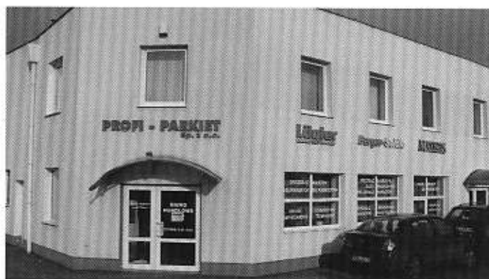
Profi Parkiet's present headquarters in Warsaw.

The 2-component water-based polyurethane finish from Berger-Seidle is by far the top selling product of the range according to Tomasz Kuciak. Varnish is still the main coating used on parquet installed in Poland. However, oil application has risen to 10%, restrained only by problems with maintenance.