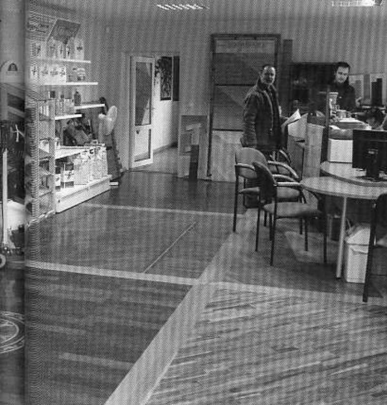
The showroom displays various parquet patterns, tools and installation materials.

ment did not result in the expected turnover. After one year the effort was shut down.